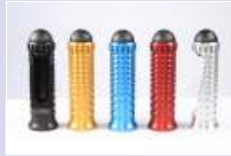
FOOTPEG 80mm, TYP R COLOUR BLACK, RED, BLUE, GOLD, ALUMINIUM COD 807 R PRICE: 16€