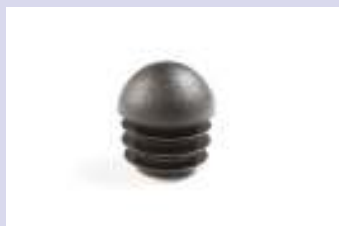
PLASTIC END FOR FOOTPEG COD 812 PRICE: 0,40€