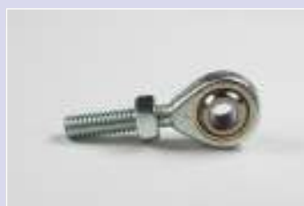
JOINT M6 LEFT/ RIGHT COD 816 L/ 816 R PRICE: 12€