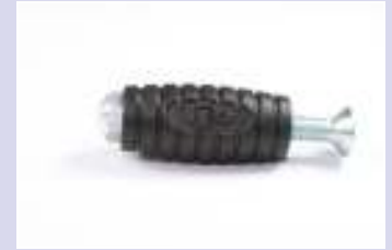
PLASTIC END FOR BRAKE OR SHIFT LEVER COD 810 PRICE: 4€