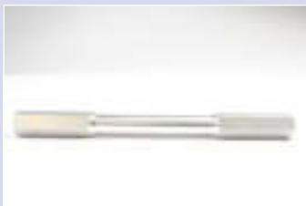
ROD COD 818 PRICE: 9€