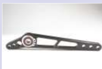
LEVER incl. ball bearings COD 830 - 849 PRICE: 41€ (photo illustration)