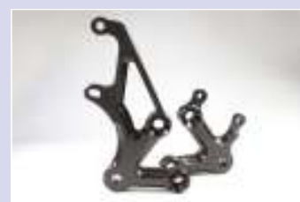
SMALL PLATE left or right side COD 850 - 889 PRICE: 21€ (photo illustration)