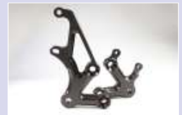
SMALL PLATE left or right side COD 850 - 889 PRICE: 21€ (photo illustration)