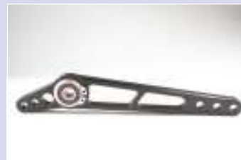
LEVER incl. ball bearings COD 830 - 849 PRICE: 41€ (photo illustration)