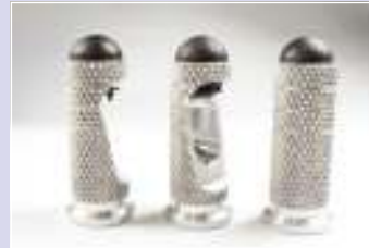
FOOTPEG 65mm COD 807 K