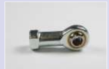
JOINT M8 COD 817 PRICE: 12€