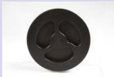
QUICK RELEASE GAS CAP COD 399R PRICE: 40€