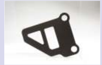
RIGHT PROTECTION IN ALLUMINIUM COD 814 RA Ø 8,5/49mm - spacing of holes PRICE: 7€