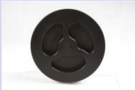
QUICK RELEASE GAS CAP COD 399R PRICE: 40€