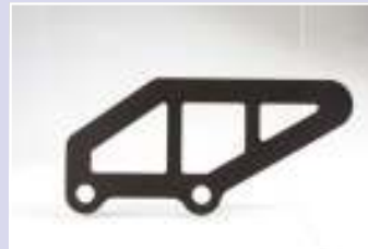
LEFT PROTECTION IN ALLUMINIUM COD 813 LA PRICE: 7€