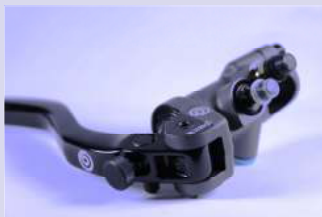
Lever for radial brembo pump 19x16, 18, 20 2020 Short version 2020K