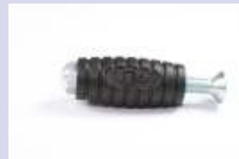
PLASTIC END FOR BRAKE OR SHIFT LEVER COD 810 PRICE: 4€