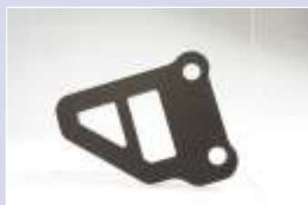
RIGHT PROTECTION IN ALLUMINIUM COD 813 RA Ø 7/46mm - spacing of holes PRICE: 7€