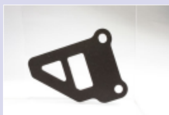
RIGHT PROTECTION IN ALLUMINIUM COD 813 RB Ø 8/41mm - spacing of holes PRICE: 7€