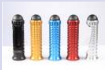
FOOTPEG 80mm, TYP R COLOUR BLACK, RED, BLUE, GOLD, ALUMINIUM COD 807 R PRICE: 16€