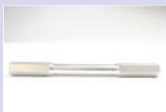
ROD COD 818 PRICE: 9€