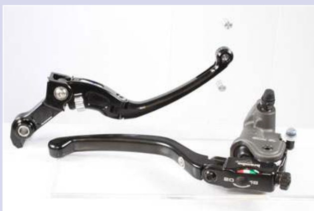
Lever for radial brembo pump 19RCS 2028 Short version 2028K