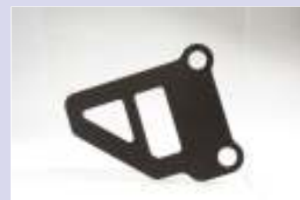
RIGHT PROTECTION IN ALLUMINIUM COD 814 RA Ø 8,5/49mm - spacing of holes PRICE: 7€