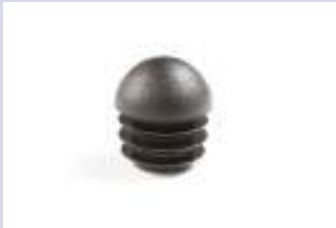
PLASTIC END FOR FOOTPEG COD 812 PRICE: 0,40€