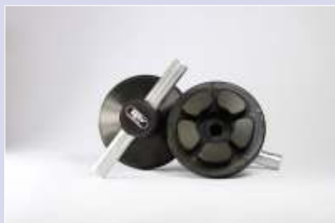
SPANNER FOR GAS CAPS WITH A THREAD COD 397 PRICE: 36€