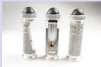
FOOTPEG 80mm COD 807 PRICE: 16€