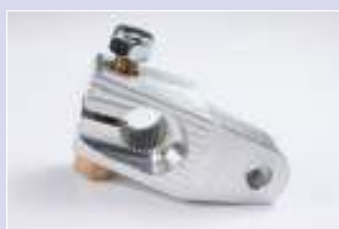
SPACER for transmission axle COD 829 PRICE: 30€