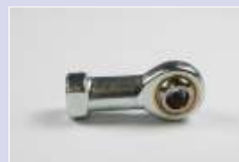
JOINT M8 COD 817 PRICE: 12€