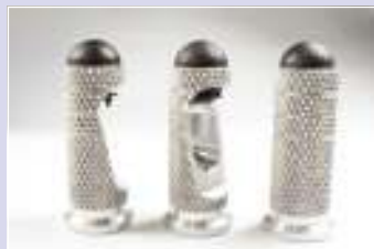
FOOTPEG 65mm COD 807 K