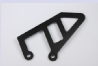
LEFT PROTECTION IN ALLUMINIUM COD 813 LB Ø 8/41mm - spacing of holes PRICE: 7€