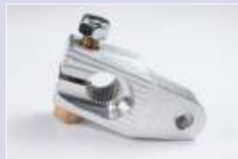
SPACER for transmission axle COD 829 PRICE: 30€