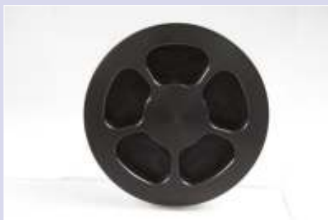
GAS CAP WITH A THREAD COD 398 PRICE: 32€