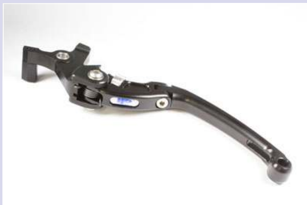
STANDARD LENGHT PRICE: 92€ COLOURS BLUE(B), RED(R), BLACK(C), GOLD(G) AND ALUMINIUM(S)

PP Tuning levers have full guarantee against breakage for 3 years. This guarantee is even valid by braking PP products by crash. We are not asking how you broke it or where you broke it – you broke it, we are going to replace it for free. "UNBREAKABLE GUARANTEE" – www.pptuning.eu