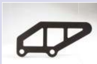
LEFT PROTECTION IN ALLUMINIUM COD 813 LA PRICE: 7€