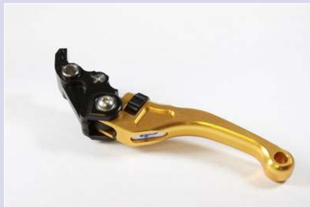
SHORTER LENGHT PRICE: 78€ COLOURS BLUE(B), RED(R), BLACK(C), GOLD(G) AND ALUMINIUM(S)