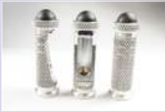
FOOTPEG 80mm COD 807 PRICE: 16€