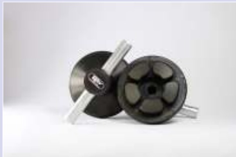
SPANNER FOR GAS CAPS WITH A THREAD COD 397 PRICE: 36€